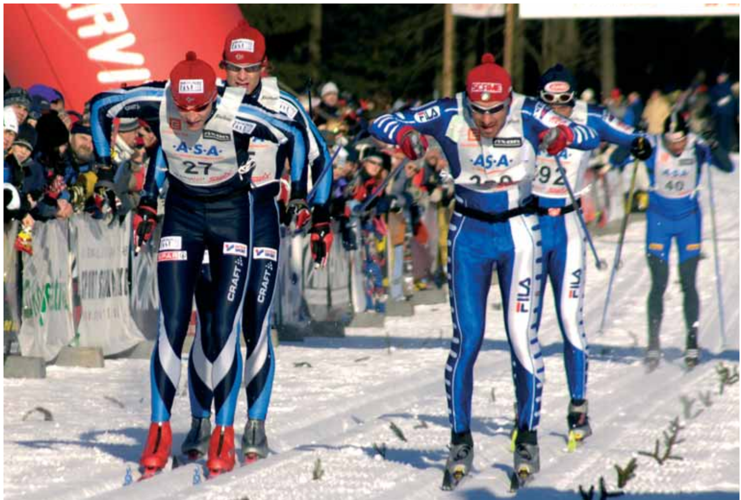
The fight for the first position – Norway vs Italy